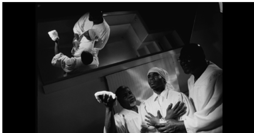
Still: "America"/Field of Vision

AMERICA by Garrett Bradley is a cinematic omnibus rooted in New Orleans that challenges the idea of Black cinema as a "wave" or "movement in time," proposing, instead, a continuous thread of achievement. Inspired by the earliest surviving feature-length film with an all-black cast, Bradley conjures a series of stunning black-and-white vignettes of joy, domesticity, and triumph.