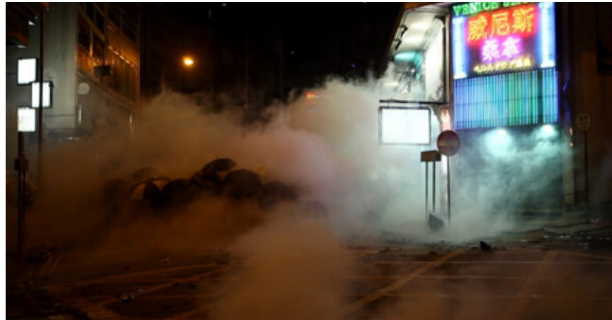
Still: "Do Not Split"/Field of Vision

government backlash, the passage of the new Beijing-backed national security law, and the protests that captured the attention of the world. After the Academy Award nomination, censors in Hong Kong were given the power to vet films that authorities said may endanger national security. The Chinese government censored coverage of the Academy Awards, and a major Hong Kong broadcaster dropped the broadcast of the awards ceremony entirely.