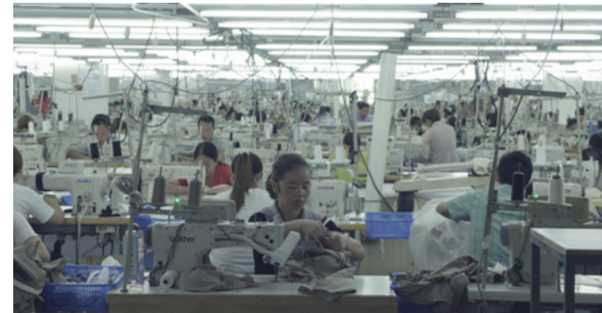
Still: "Ascension"/Field of Vision

Projects supported by Field of Vision illuminate and impact the world around them. Many premiered at top-tier film festivals around the globe and were nominated for or won prestigious awards in 2021. 2021 also marks the sixth consecutive year when Field of Vision-supported films were shortlisted and/or nominated for an Academy Award. Impressively, seven Field of Vision films had their broadcast premiere on television's longest-running showcase for independent nonfiction film, POV on PBS.