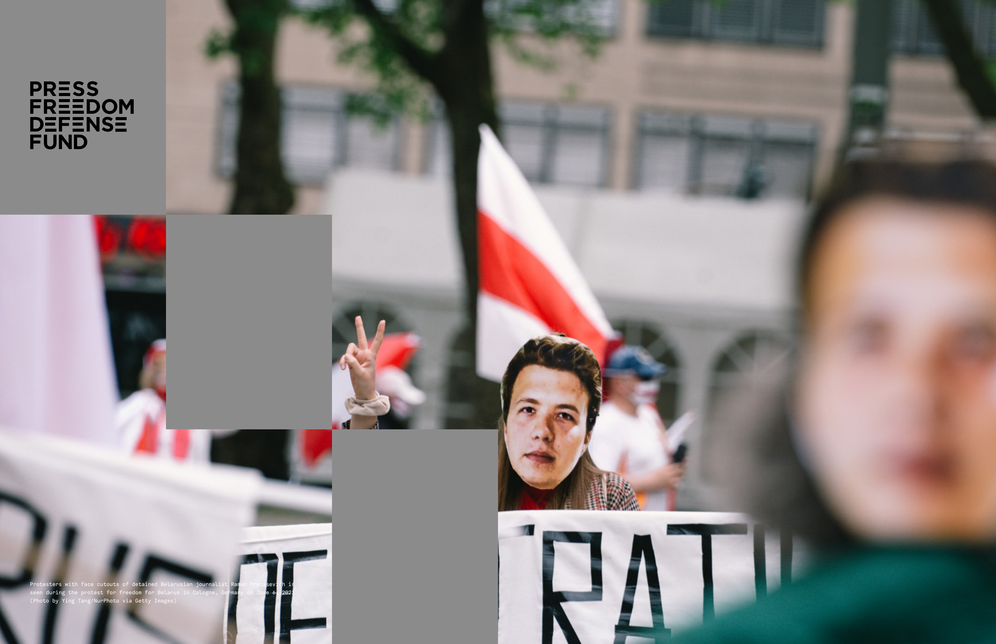
Protesters with face cutouts of detained Belarusian journalist Raman Pratasevich is seen during the protest for freedom for Belarus in Cologne, Germany on June 6, 2021.